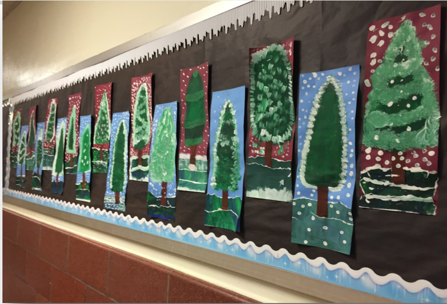
A shout out to the 5th graders at Lincoln School for beautiful tree art for their hallway!

Soon the snow will give way to Spring! So, why not plan to plant a tree in your yard and enjoy years of cool shade, colorful flowers & fall foliage, and a nice landscape with low maintenance.